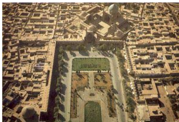
"Aerial view of Imam Square"

Isfahan's main monuments are centred around the following areas; the Imam Square (or Royal Square), the Friday Mosque, and the bridges on the Zayandeh Rud. The centre of Isfahan during the Seljuk period was the Friday Mosque. Today, the mosque is like a patchwork of history with a winter hall that is probably Timurid ; minarets built by the " Black Sheep " tribe and the interior decorated by the Safavids . In 1598, Shah Abbas decided to shift this centre to the present day Imam Square - according to some, in order to annoy a rich merchant who was reluctant to part with his property.