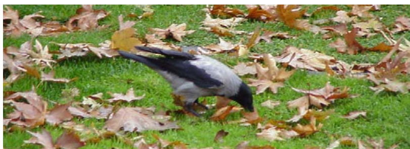
An IPM Resident