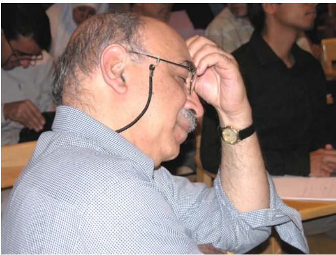
God! Not again.