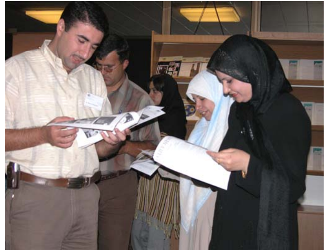
Reading DAILY NEWS