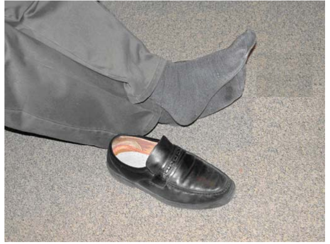
Where is the other shoe?